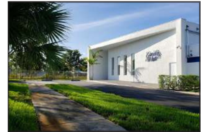
We extend and upgrade our West Palm Beach and San Francisco facilities.